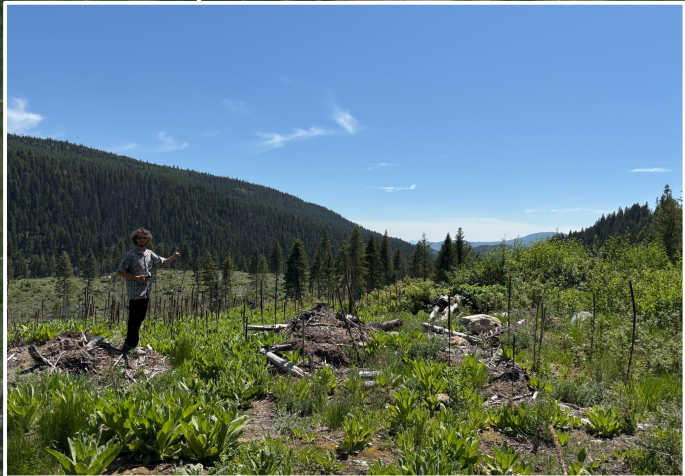
Enjoy the view!

Trailhead begins on Big White Road across from Okanagan Observatory on Okanagan Falls FSR