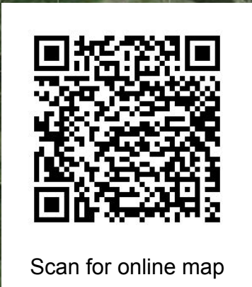
Scan for online map